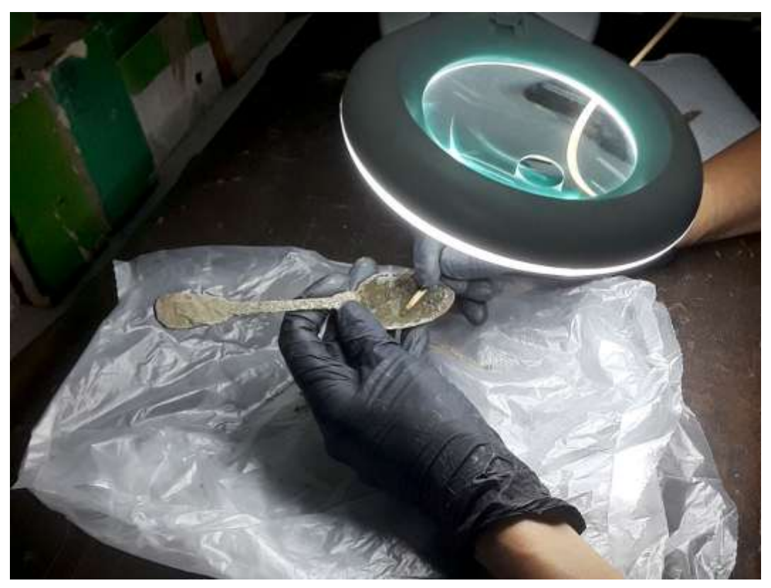
Dry cleaning of a spoon, site Aduana de Taylor, Centre for Urban Archaeology, IAA, FADU, UBA, 2018.