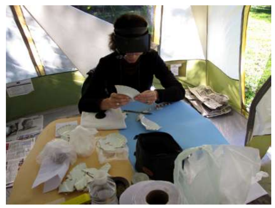
In situ laboratory inside a tent, site Teyú Cuaré, Misiones, Argentina, 2015.